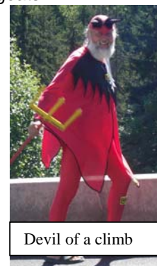
Devil of a climb

We took shelter at a covered bus-stop. Traffic up the mountain was heavy despite the rain. Suddenly laughter: something orange flew out of an open car window and struck me on the leg. I inspected it leerily, wondering if it might explode, then I realized that here was our first Tour SWAG: Geeky inflatable Radobank helmets.