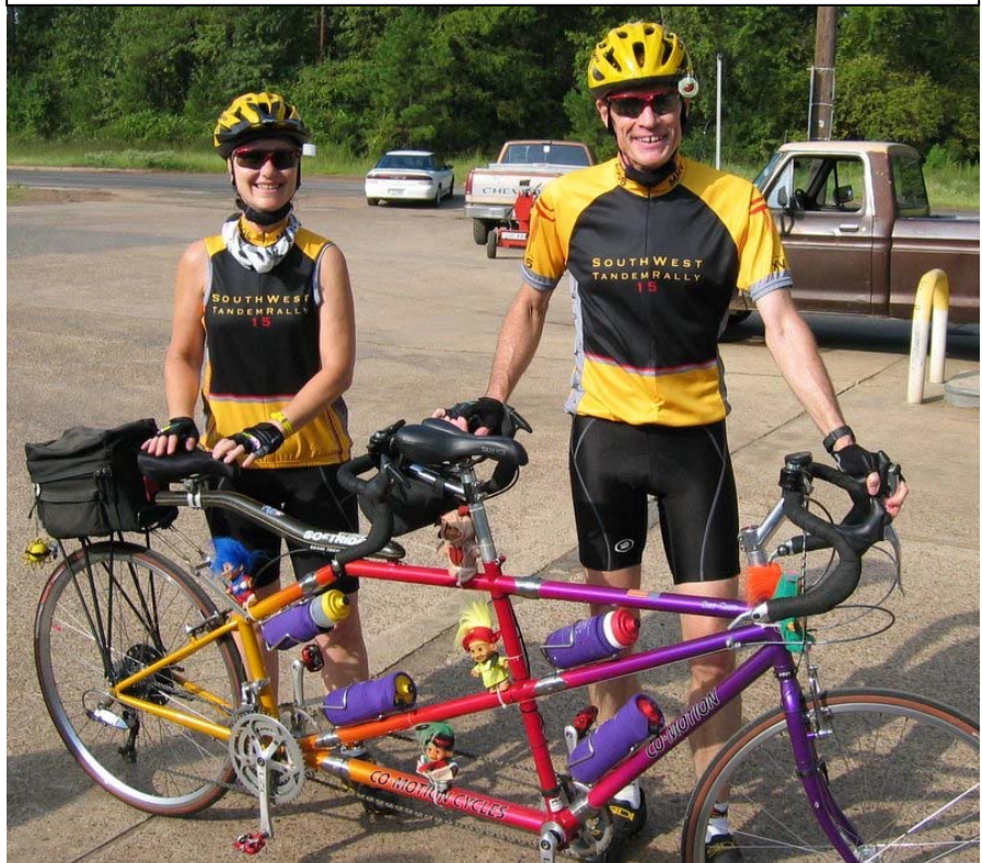
Look closely, can you find all five trolls attached to the Hunts' tandem?

Jefferson is a beautiful place to ride: tall trees, the scent of pine, and fall wild flowers at the road's edge. Friday afternoon's 20 mile ride included an overlook of Lake O' the Pines and Reggie waiting with ice cream. Life is good!