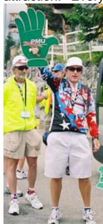
Woody collects SWAG

The next day was a race viewing day! The Stage route ran right by our hotel and finished 3km up the road. We rode an early out and back to Meribel, finishing up that d#mn hill again. By now there were camper vans shoehorned into every possible spot. El Diablo, the famous devil fan had his trailer parked at Courchevel 1550 and we passed him walking back up from 1300. T-Mobile signs were everywhere and though they haven't had a win for ages, I could see the attraction. Every group seemed to come with its own fully kegged and well attended beer tent.