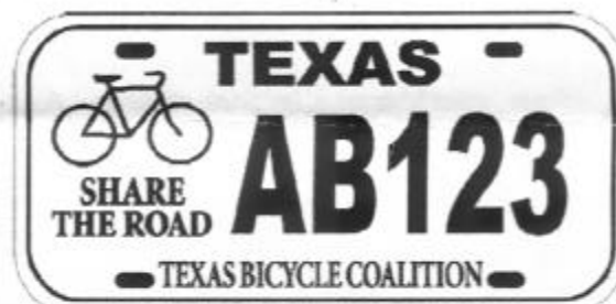
Sample License Plate - Subject to Change

You can help pass this legislation that won't cost any tax dollars in these tight budget times. To find out more about this and our other legislative efforts, visit www.biketexas.org .