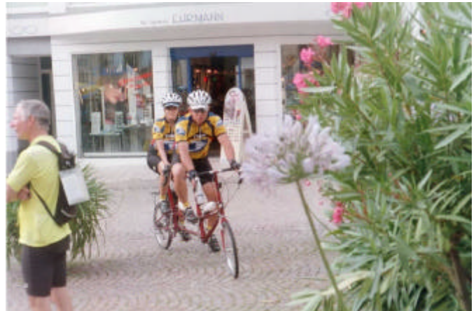
Team Watson stops for a break in Niederstetten

In a local Bamberg bike shop, filled with biking antiques and ultra-modern machines, we discovered there had been some very ingenious ideas for tandem bicycles hidden away in the backstreets of Germany. One seated the riders side by side, pedaling independently and another had a double diamond shaped frame that defies my limited descriptive ability.